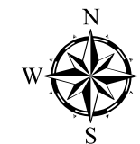
Figure 1 Sheet 1 of 5 Base map date: 3/11/2014 Refer to CTP document for more details